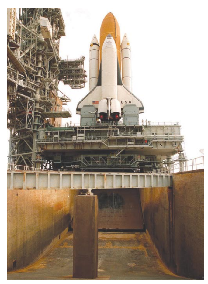
The Shuttle and MPLM sit above the flame trench.

Liquid oxygen (LOX) used as an oxidizer by the orbiter main engines is stored in a 900,000-gallon tank on the pad's northwest corner, while the liquid hydrogen (LH2) used as a fuel is kept in an 850,000-gallon tank on the northeast corner. The propellants are transferred from the storage tanks in vacuum-jacketed lines that feed into the orbiter and external tank via the