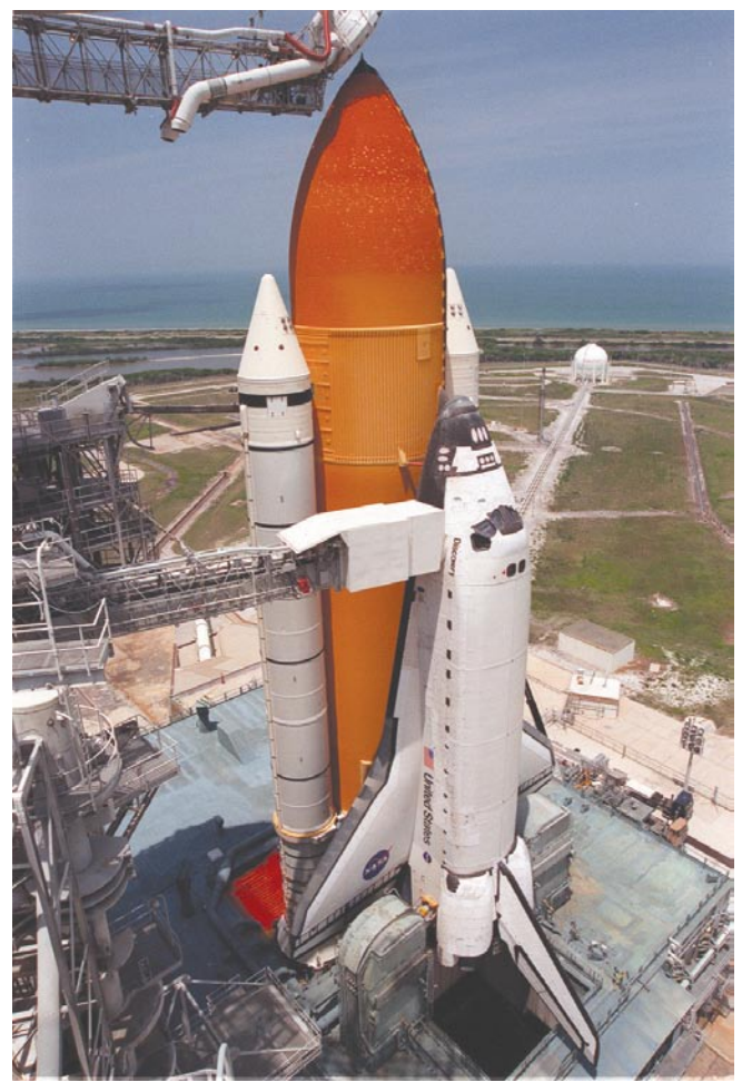
With the Shuttle on the pad, the Orbiter Access Arm and White Room is extended to the cockpit entry. Above the orange external tank is the "beanie cap" or vent hood.

The FSS is each pad's most prominent feature, standing 347 feet from ground level to the tip of