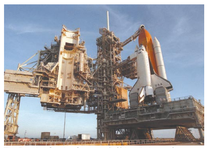
The Rotating Service Structure (left) is rolled open for launch. Entry to the Payload Changeout Room is exposed.

The RSS (seen in photo at left) provides protected access to the orbiter for installation and servicing of payloads at the pad, as well as servicing access to certain systems on the orbiter. The majority of payloads are installed in the vertical position at the pad, partly because of their design and partly because payload processing can thus take place further along in the launch processing schedule.