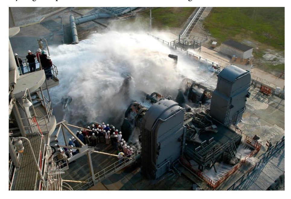
(Left) Water is released onto the Mobile Launcher Platform on Launch Pad 39A at the start of a water sound suppression test.

The system reduces acoustical levels within the orbiter payload bay to about 142 decibels, below the design requirement of 145 decibels.