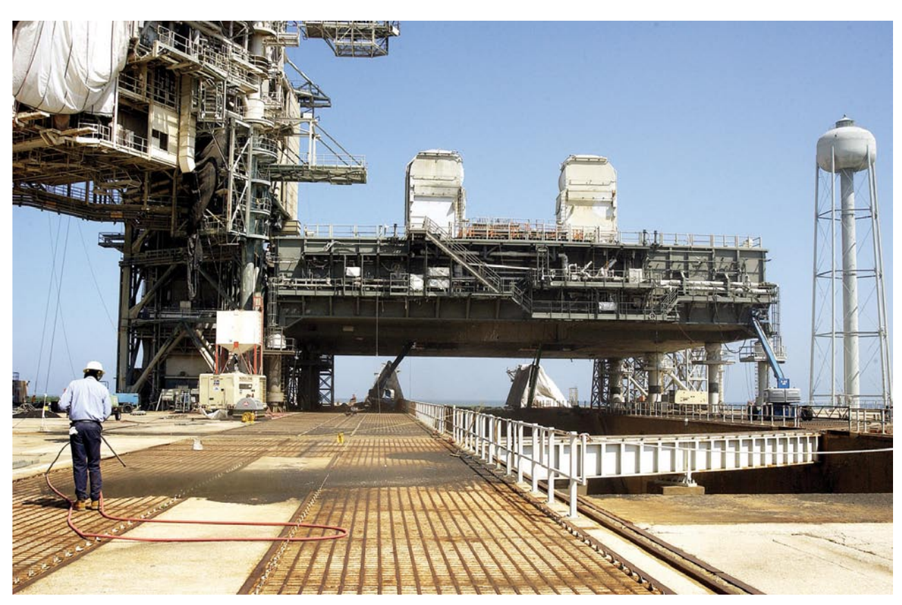
A worker sandblasts the surface behind the Mobile Launcher Platform on Launch Pad 39A. Routine maintenance includes sandblasting and repainting to minimize corrosion.

Corrosion of metal structures are endemic to the waterside environment. The metal pad structures are stripped and repainted on a recurring basis. Sand blasting and repainting are best done during a Mod Period because they stop all other work and create a foreign object debris situation.