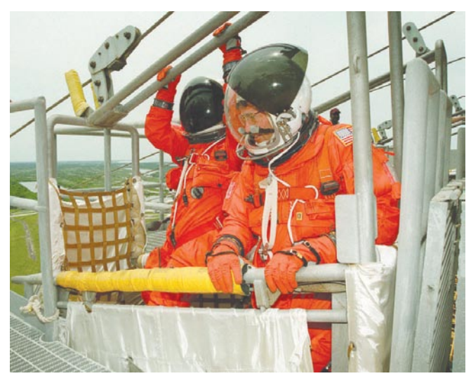
Astronauts climb into the slidewire basket on the Fixed Service Structure. The basket is part of the emergency egress system.

The system includes seven baskets suspended from seven slidewires that extend from the FSS to a landing zone 1,200 feet to the west. Each basket can hold up to three people (see photo above). A braking system catch net and drag chain slow and then halt the baskets sliding down the wire approximately 55 miles per hour in about half a minute. Also locat-