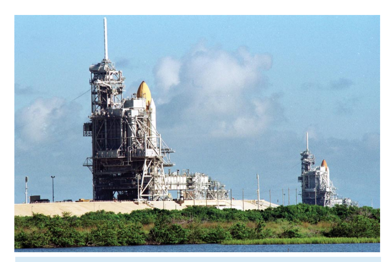
Space Shuttle Discovery (left) and Space Shuttle Atlantis (right) both stand ready on their Launch Pads (39A and 39B respectively). Atlantis launched first, July 12, 2001, on mission STS-104. Discovery launched Aug.10, 2001, on mission STS-105. Towering above each Shuttle at left is an 80-foot-tall lightning rod, part of the lightning protection system at the pads.